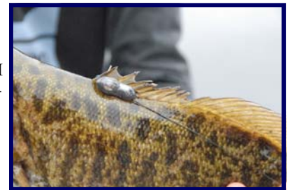
Pictured above is the tracking device Tim attached to the bass