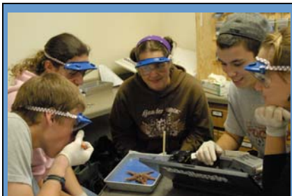
Above, a team of High School students dissect a starfish. This is part of the anatomy and physiology course they have designed to better understand systems within an organism.