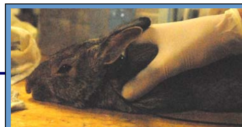
Wildlands Students are tracking a rabbit this fall using radio telemetry—updates soon!

PowerPoint slideshow to go along with the map. It was hard taking good close up, detailed pictures of a mushroom. Some of the pictures didn't turn out very good, but a few looked really nice.